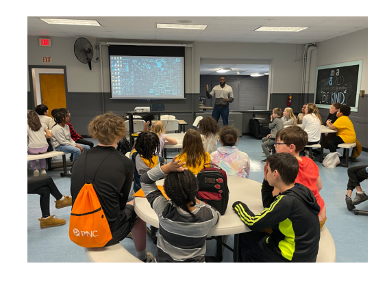
STREAM Day Celebration