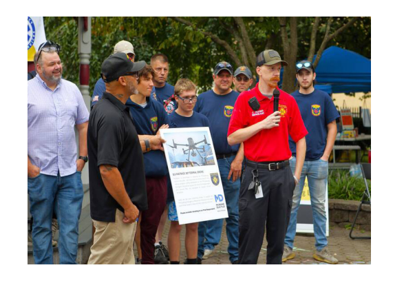
First Responders Day