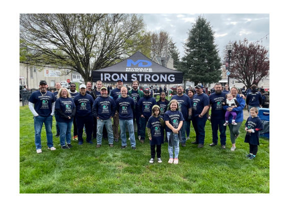
Community Day of Action

We are proud to support and give back to Phillipsburg through local partnerships, community projects, and charitable initiatives. These are just some of the ways that we engaged in 2024.