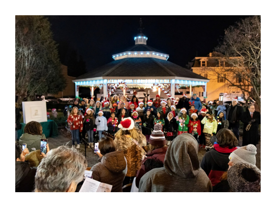
Tree Lighting Ceremony