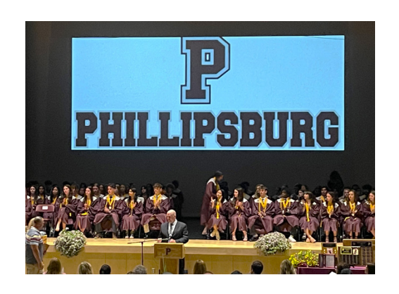
Phillipsburg High School