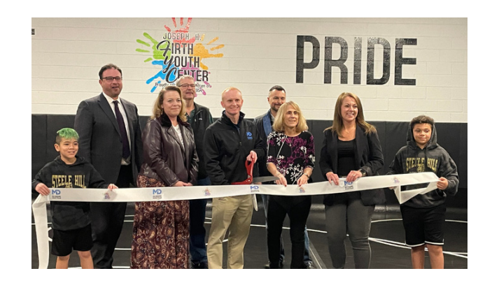
Firth Youth Center